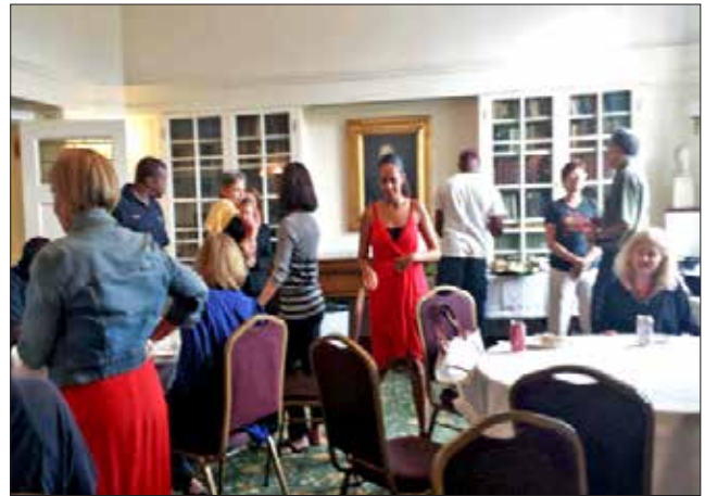
More NYSEC staff and friends at the party.