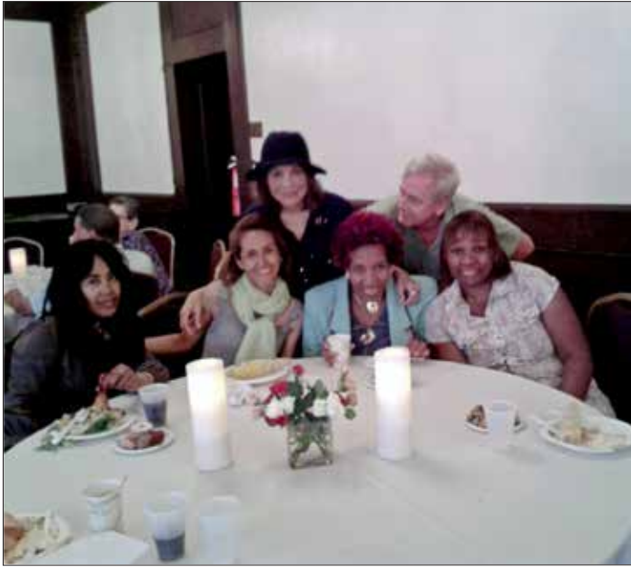
Volunteer Dinner guests.