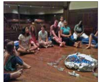
The proverbial Ethical Bonfire.