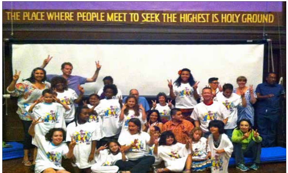
The sleepover community at NYSEC.

NYSEC's Ethics for Children hosted two wonderful Family Sleepover events in July. Families literally made themselves "at home" here, even those who were experiencing Ethical Culture for the first time. As an instantaneous Ethical village of a kind, we made art, picnicked, played, and participated in intergenerational workshops. We sang lullabies and shared