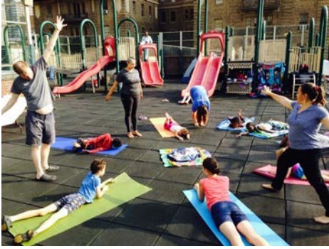
Yoga on NYSEC roof after sleepover