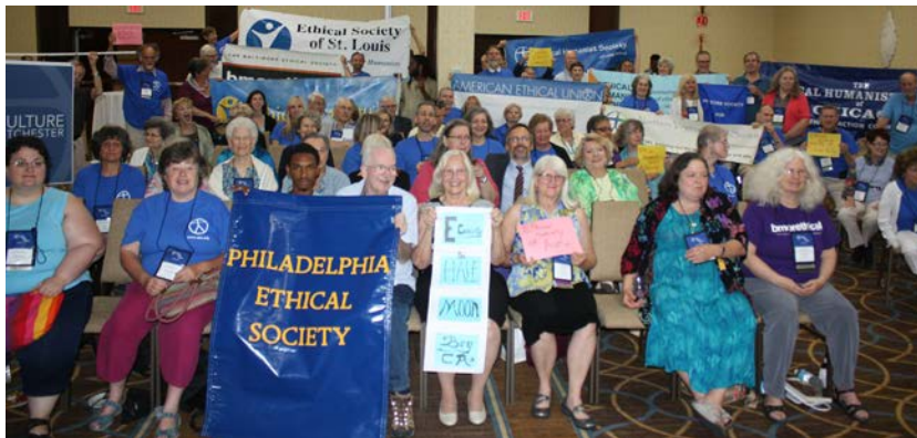
Members at American Ethical Union Assembly