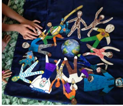
Ethics for Children animation